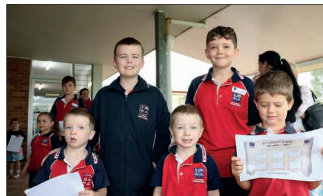
Happy snaps from the Open Morning,

Anyone who would like to enquire about enrolling their child in the school, whether it is for a Prep next year or student of any year level, should call the school on 4666 3551.