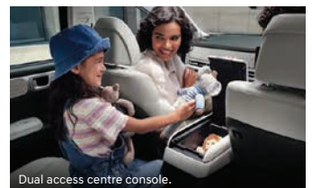
Dual access centre console.