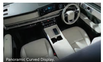
Panoramic Curved Display.