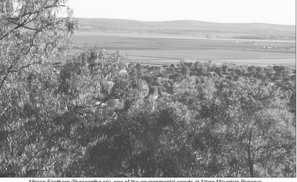
African Firethorn (Pyracantha sp), one of the environmental weeds at Allora Mountain Reserve

grasslands on basalt and fine-textured alluvial plains of northern New South Wales and southern Queensland, Semievergreen vine thickets of the Brigalow Belt (North and South) and Nandewar Bioregions, Weeping Myall Woodlands and White Box-Yellow Box-Blakely's Red Gum Grassy Woodland and Derived Native Grassland.