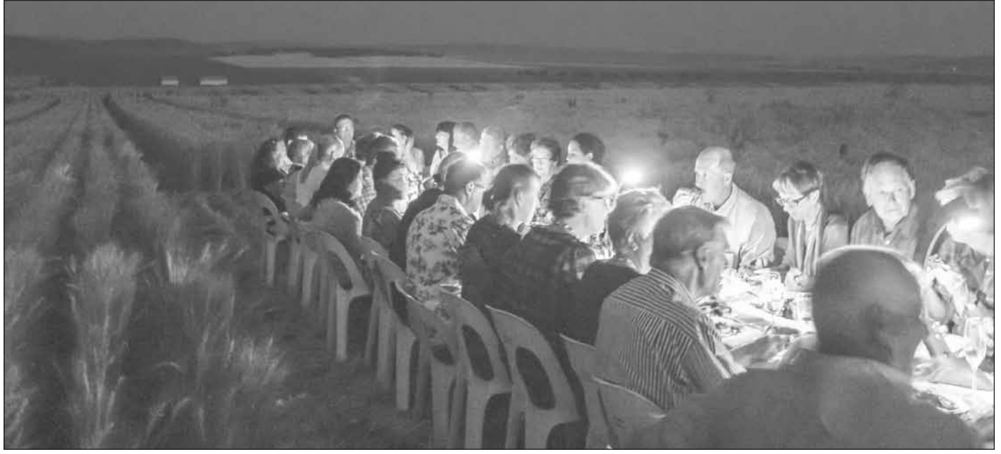
10 - THE ALLORA ADVERTISER ... THURSDAY, 13th NOVEMBER 2014

"I would like to see two main events for the Felton region each year focus on local food and farmers."