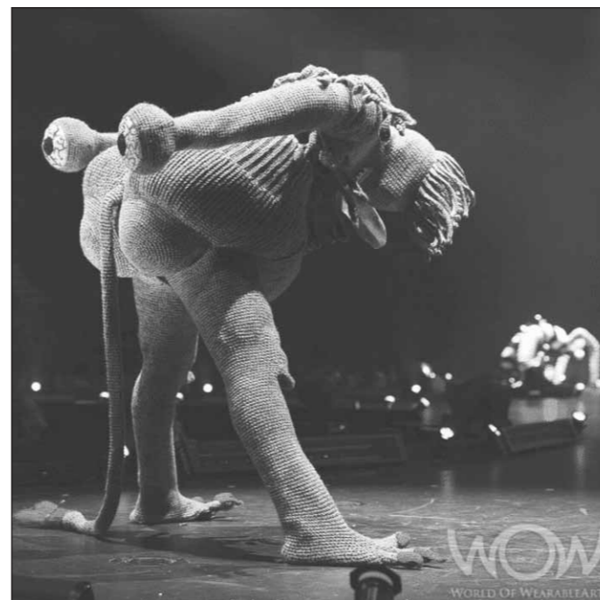
Wearable art monster - "Gary".