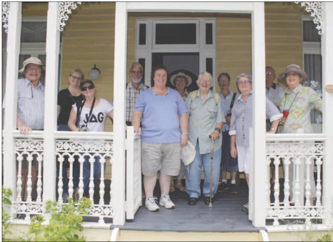
Chinchilla Field Naturalists on verandah of Dalrymple House.