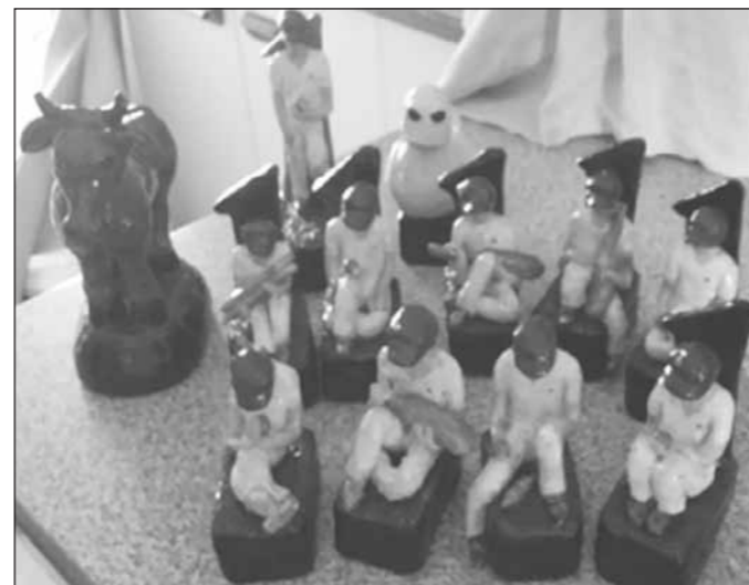
Rascals Presentation Night trophies.