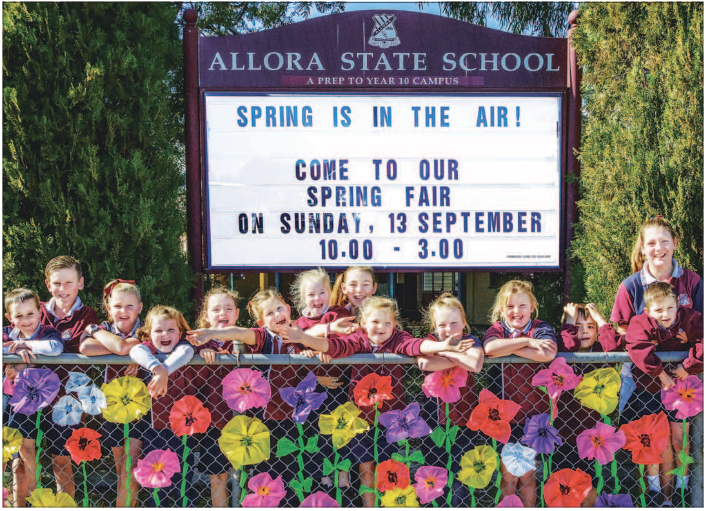
Spring Fair flowers on the fence at Allora P-10 State School