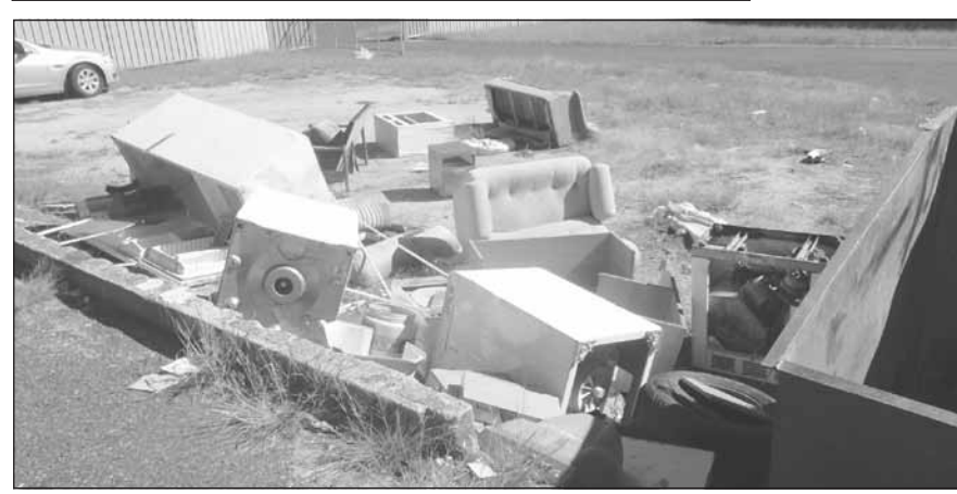
Illegally dumped waste at a Southern Downs Regional Council Transfer Station.

If people wish to contact The Allora Advertiser and discuss their particular needs, please feel free to do so. Ph 4666 3128.