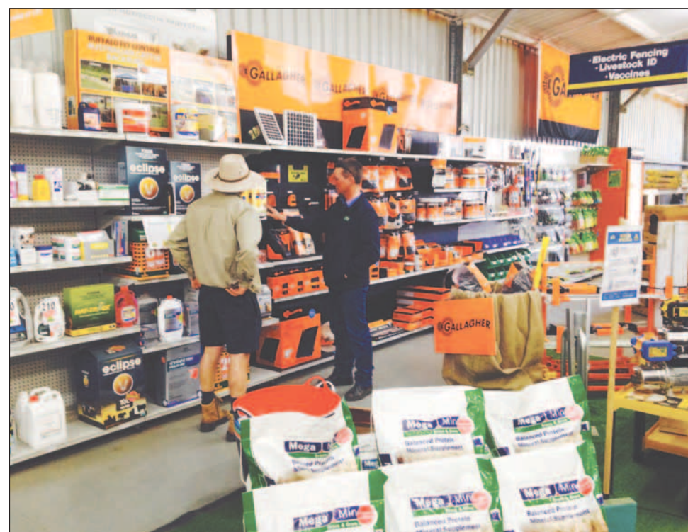
Raff Group CRT Rural Trade Show will be held on site at Raff Group Clifton

The CRT Rural Trade Show will run from 10am to 3pm on