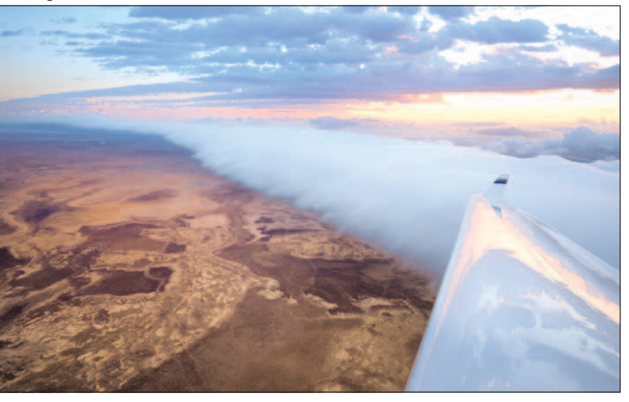
The Morning Glory.