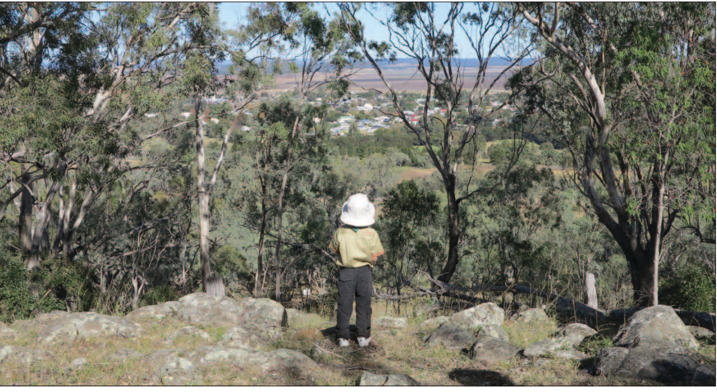
Looking down at Allora town from the top of Allora Mountain Flora and Fauna Reserve

To assist the Group meet the annual cost of the lease, they have started a Crowdfunding site. If you would like to assist in