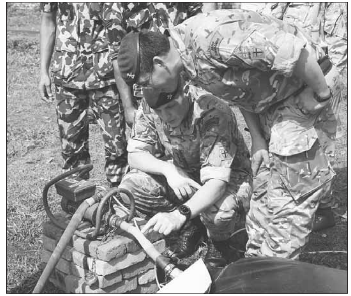
Gurkha engineers construct a water purification system for people living in a camp in Kathmandu following an earthquake.

With the abolition of the Nepalese monarchy in 2008, the future recruitment of the Gukhas for British and Indian service was initially put in doubt. Elements of the new government considered that recruitment as mercenaries was degrading to the Nepalese people and would be banned. However, the Gurkha recruitment for foreign service continues. Their service brings much needed money into the economy of Nepal.