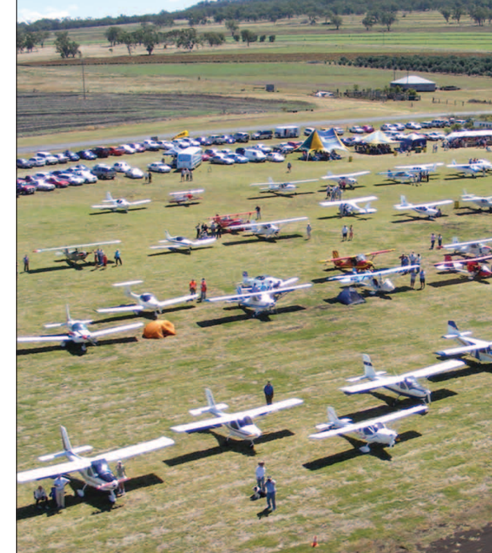
Last year approx. 130 aircraft of all shapes and sizes flew in for this great event at Clifton Airfield