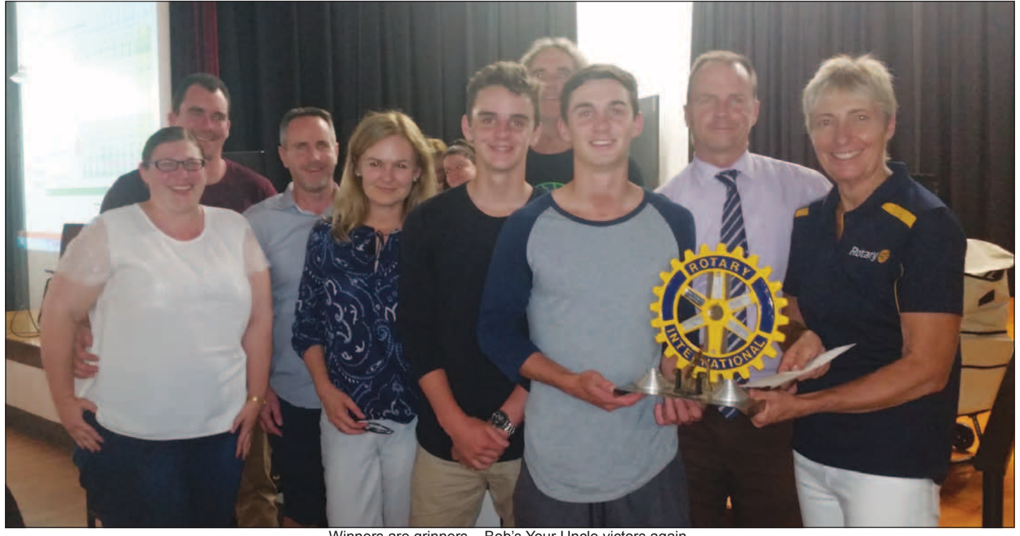
Winners are grinners – Bob's Your Uncle victors again.

How wide is Australia? If you don't know the answer to this question then you join the throngs of folk who found the baffling array of mindless minutiae of the Rotary Trivia Night on Friday night quite