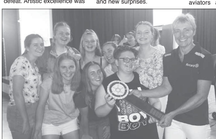
Youthful wooden spooners - Sour Patch Kids.

We look forward to seeing you all back for 2019, with the promise of new categories and new surprises.