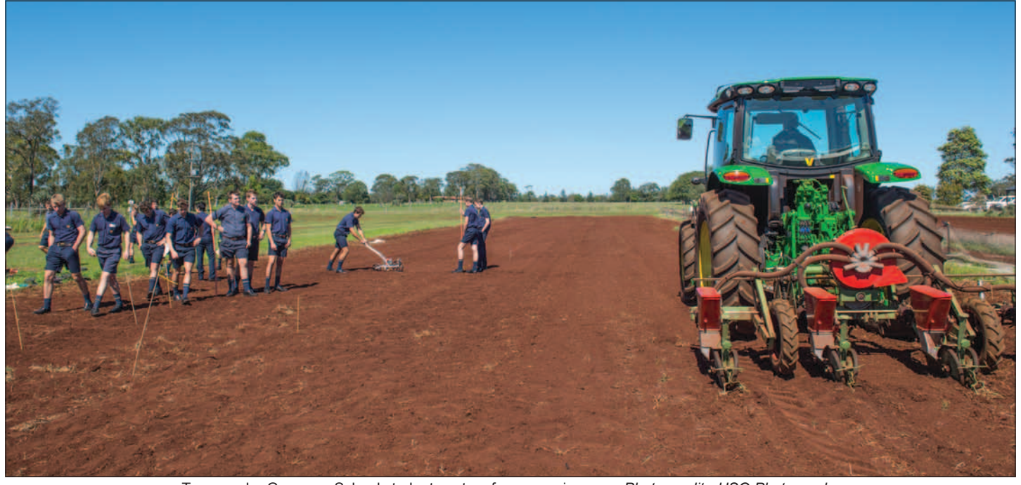
Toowoomba Grammar School students get on farm experience.

How many Year 12 students can say that they're running their own farming field trial under the tutelage of Australia's leading agricultural researchers?