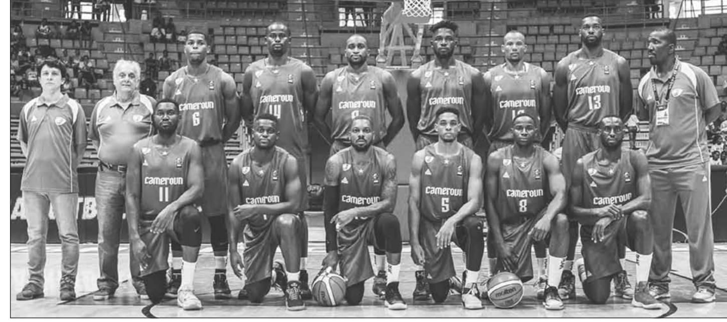
Cameroon National Basketball team.

Hoop fans across the Southern Downs are in for a treat when the Cameroon National Basketball team goes head to head with some of Australia's finest basketball athletes.