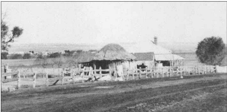
Stallman's house on the Allora-Clifton Road in 1897.

The photo taken in 1897, looking towards Allora from the Elphinstone Road corner,