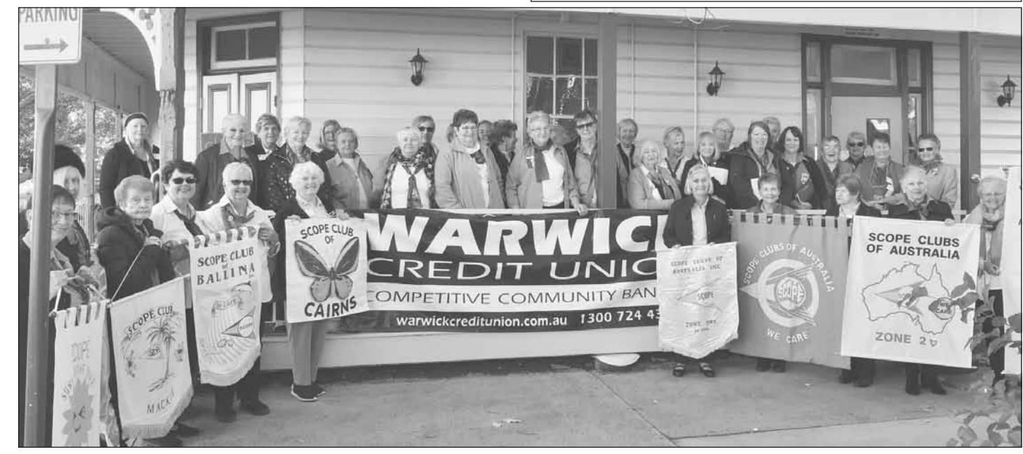
Scope National Conference representatives at official opening.