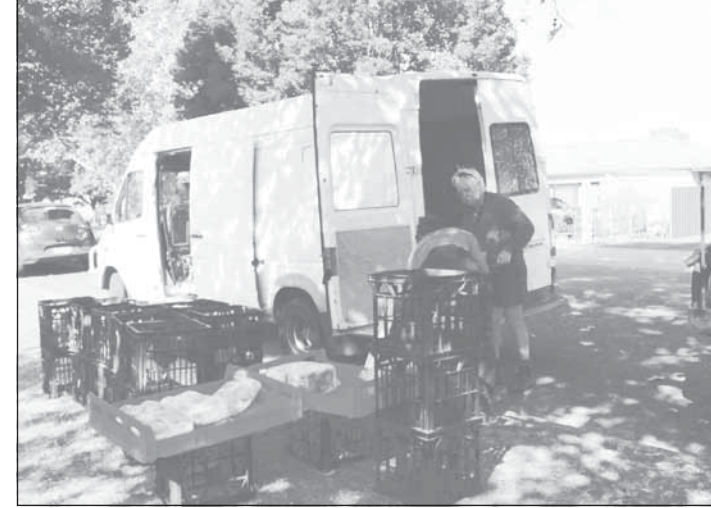
The FoodAssist van at the new Allora drop off point in Muir Street.