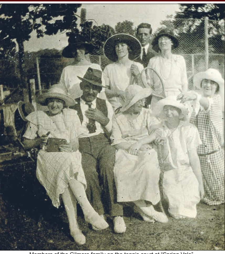
Members of the Gilmore family on the tennis court at "Spring Vale"

and lived. I can just remember Grandma sick in bed at this place, but I cannot remember her death. Vale" and subsequently the first steam milking plant. Mother said that they lived in a slab wall hut with an earthen