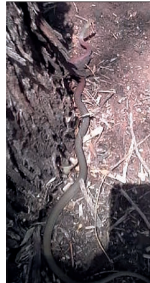
This snake was spotted las Thursday morning at Allora's Stuart Henry Park, within stumbling distance of children's swings, so keep all eyes open!