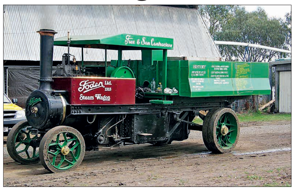
The 1918 Foden Steam Wagon will make an appearance at this year's Allora Heritage Weekend

For those who would like to see things from above,