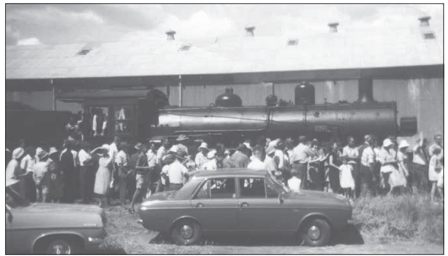
1969 excursion train to Allora in the Allora railway vards

Names of servicemen with connections to Allora which appeared on the Honour Roll published in the Courier-Mail on 10th March 1944 are: Sergeant W. N.