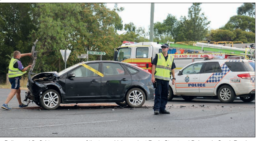
Police and firefighters on scene of the two vehicle crash at Forde Street and Dalrymple Creek Road.

Both persons were uninjured and did not require treatment by paramedics.