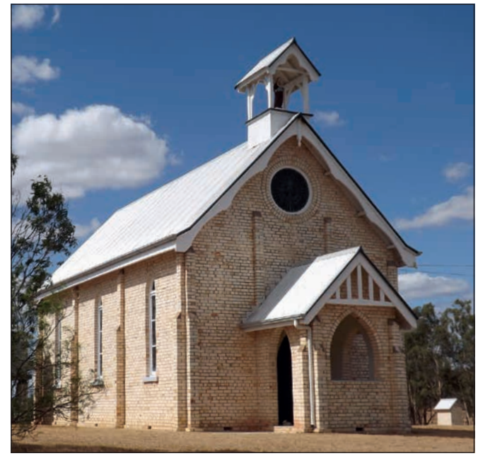
Sacred Heart Church at Deuchar.

Heart Sacred Historical booklet will also be available for purchase