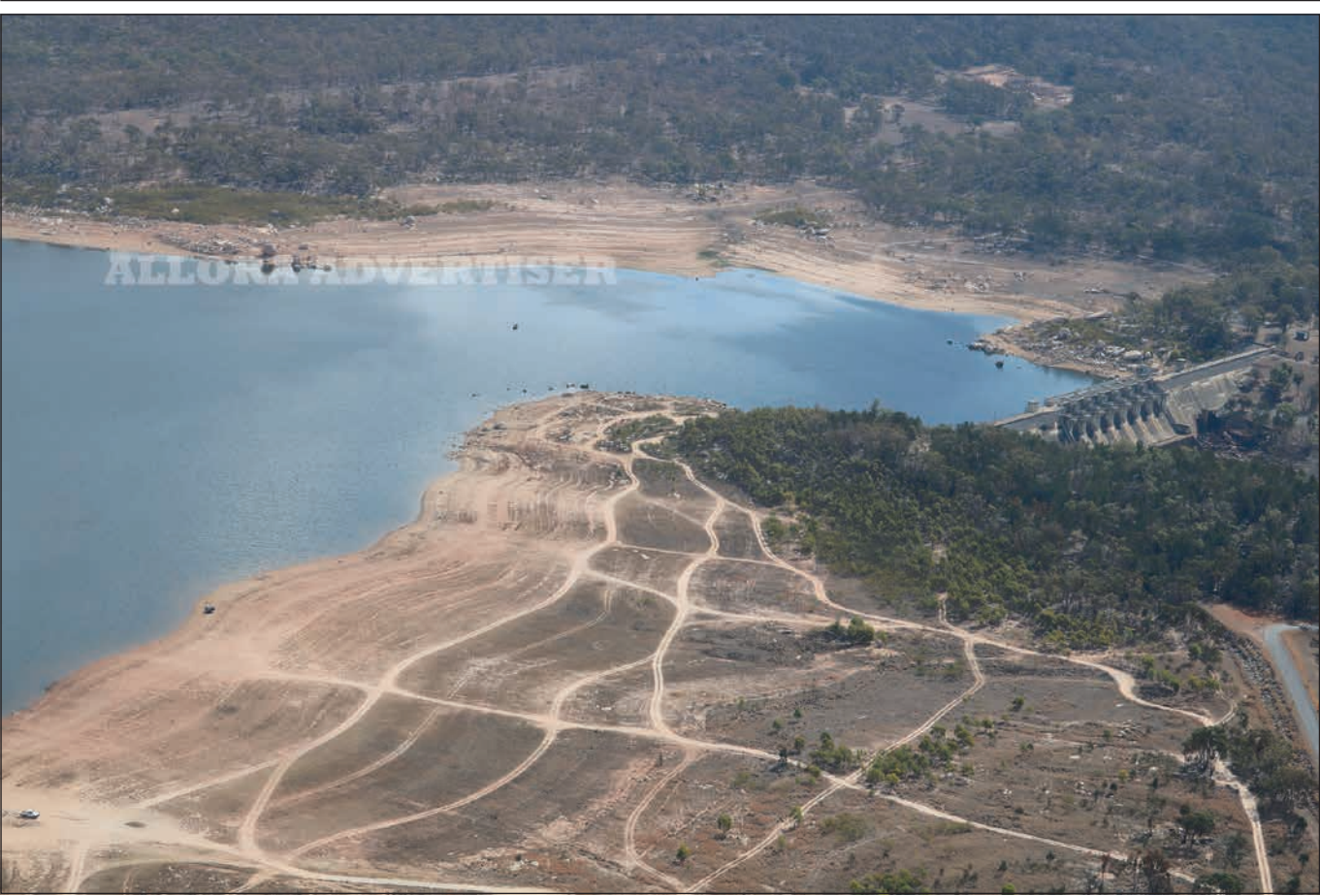
The banks of Leslie Dam, reminiscent of a desert wasteland. Photo taken with co-operation of Lone Eagle Flying School.

Critical water level restrictions of 100 litres per person per day will be introduced on the Southern Downs from 1 September 2019 as severe drought conditions and no rainfall continue to significantly impact the region's water