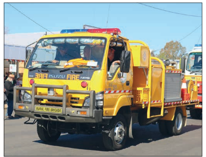
Allora & District Rural Fire Brigade.

Fire Brigade Annual General Meeting on Monday 2nd September at 7.30pm. Exceptionally hiaher than average temperatures