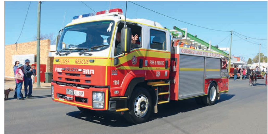
Allora Auxilliary Fire Brigade

If you're interested there's training every Wednesday at the Allora Fire and Rescue Station in Muir Street or you're welcome to attend The Allora Rural