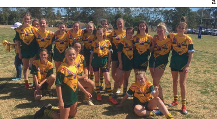
Wattles U17 girls league tag team