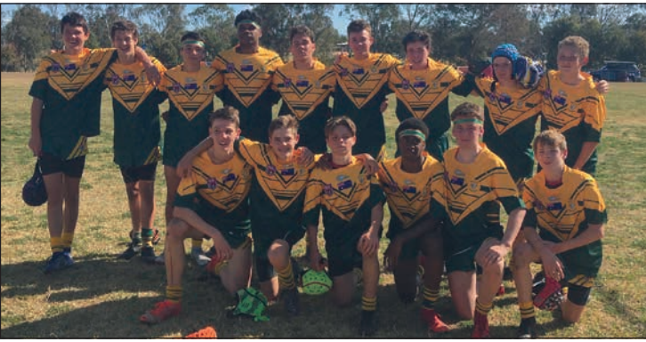
Wattles U16 team.