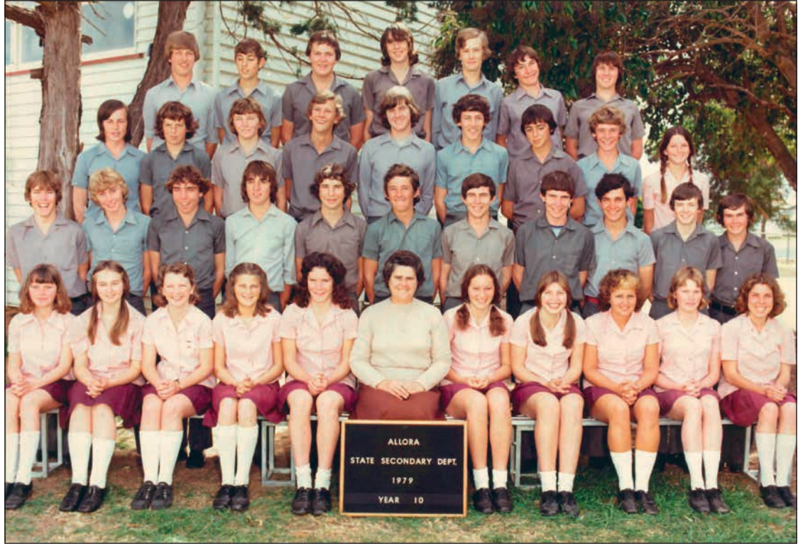
The Allora Secondary Department Year 10 Class of 1979 will celebrate their 40 year reunion with many ex-students returning. (Full story with more photos on pages 8 and 9)