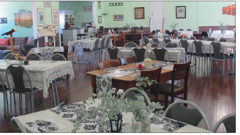
The well-appointed RSL Hall Dining Room

The building was the result of several years of planning and fund raising in the form of 'queen' competitions.