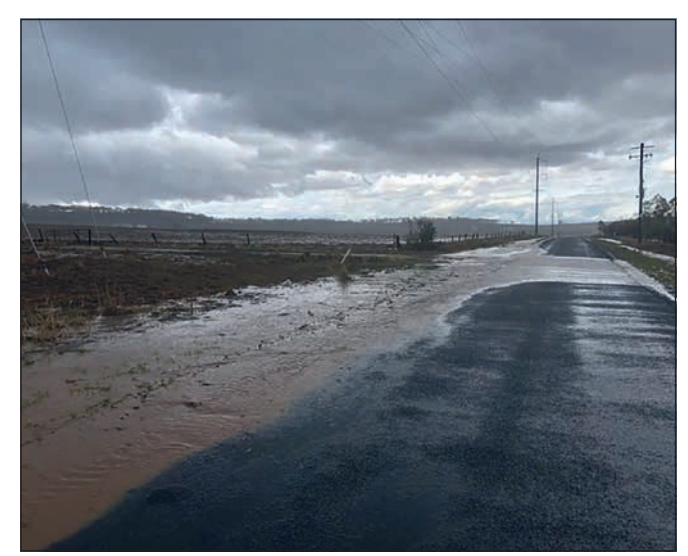
Plenty of water on the Allora-Clifton Road, near Dalrymple Landscaping (photo taken at the weekend).

After ten months of very little rain, the Allora district has received welcome falls during storms over the last week.