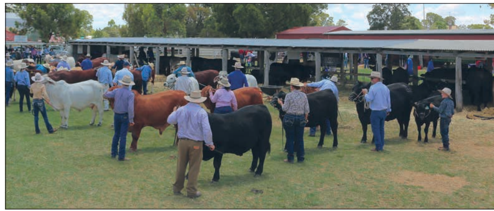
Judging of beef cattle at the 2019 Allora Show.

Special events that you won't want to miss - Friday night the Bull Ride as another round of the Border Region Buckle Series continues with Junior Bull riders going for a buckle in the series