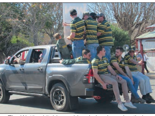
The Wattles hitching a ride, obviously saving their energy for the Finals!