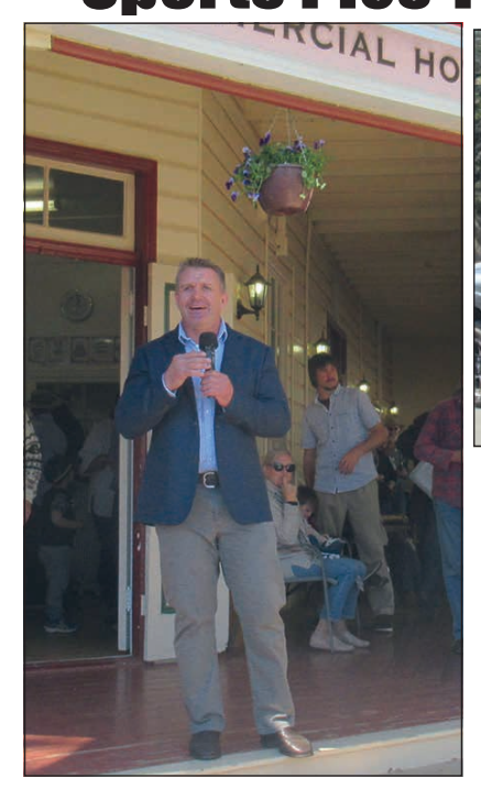
Don't laugh - I reckon I was the best Prop the Broncos ever had.