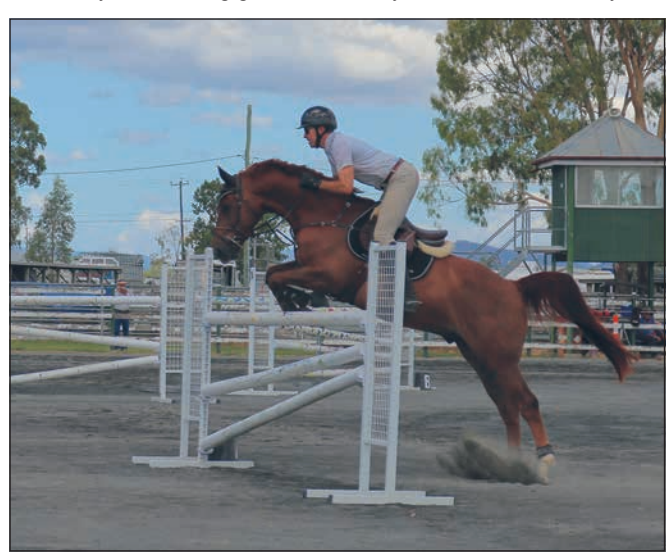
Action from the 2019 Allora Show.