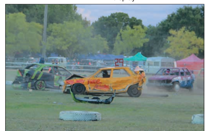
Plenty of smashing good fun at last year's Demolition Derby.

The FMX Motorcycle Spectacular is back by popular demand and everyone enjoys Smash-up Derby. Weather permitting there'll be a spectacular Fireworks display.