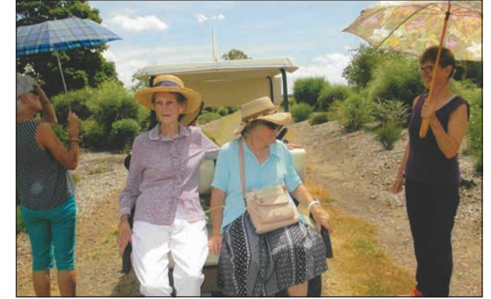
Garden Circlers surrounded by the Rail Trail 2020.

Servicing the Southern Downs & Granite Belt Region