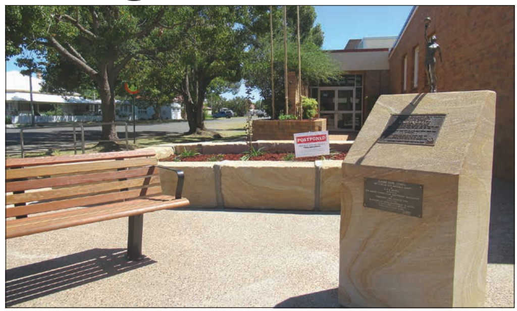
The new park and garden out the front of the Sports Museum.

During the 150 years celebrations it was reburied with 86 new and current contributions from Shire People and organisations,in a ceremony that created history thanks to Burstows Funerals.