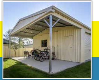
QBCC 712 053