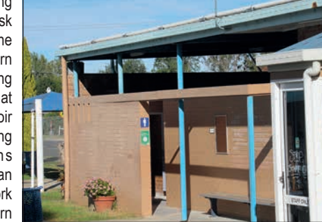
Money to be spent on disabled access showers and toilets at the Allora Pool.