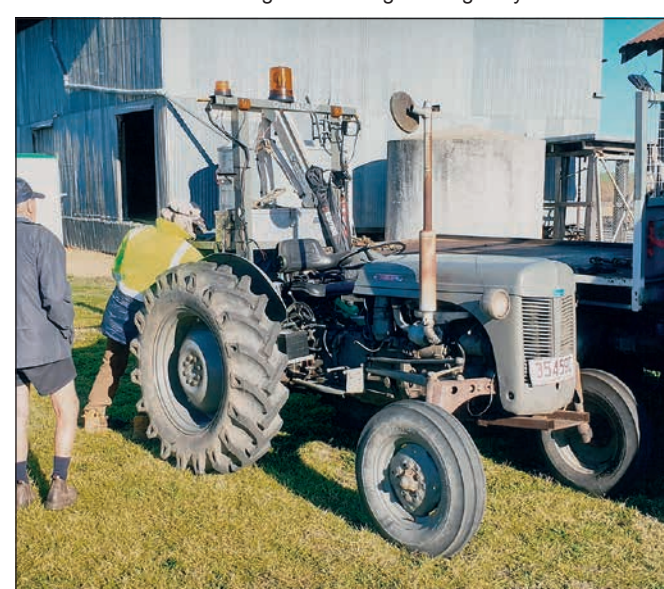
This old Ferguson Tractor located outside the Grainshed at